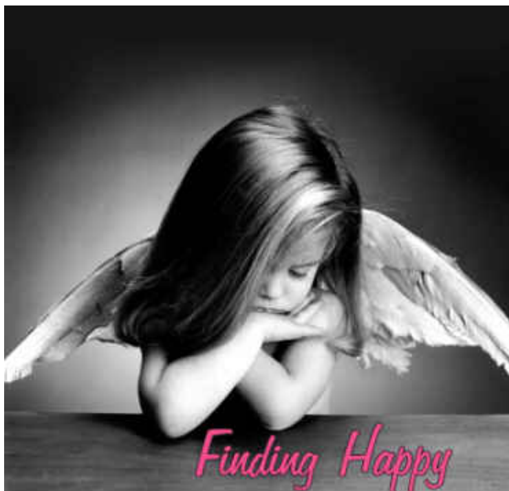
Cover for Finding Happy .